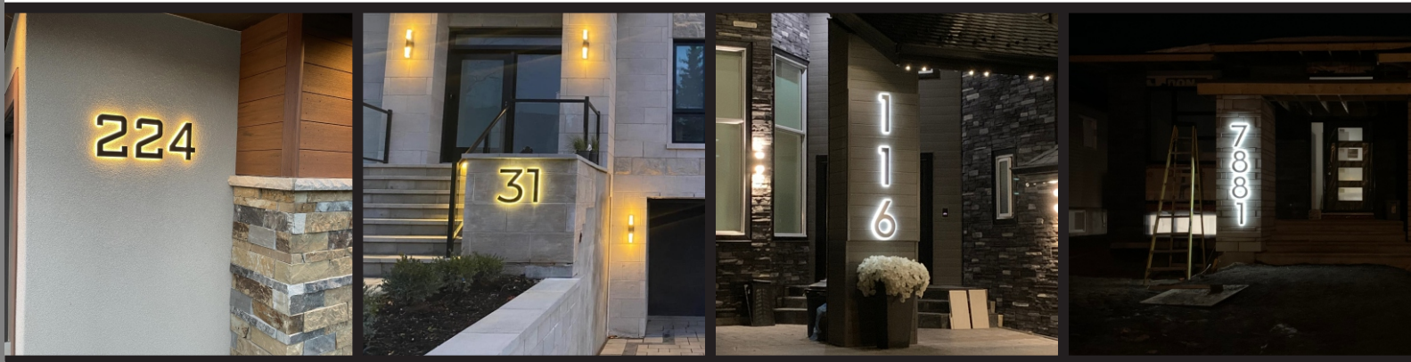
Warm White 3000K